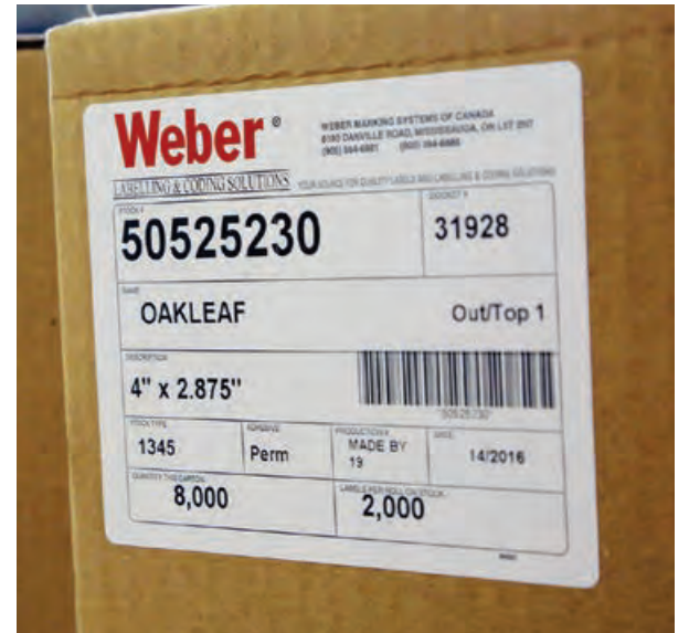
Oak Leaf utilizes a Weber Marking System label application system to apply permanent adhesive labels onto its corrugated shipping cartons.