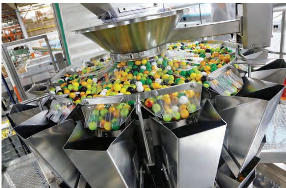
Colorful gumballs meant to look like miniature real-life apples for the Celebration by Frey brand are ready to be dispensed into one of the WeighPack PrimoCombi weigher's multi-heads for dispersal into the Swifty 3600 bagger positioned directly below.