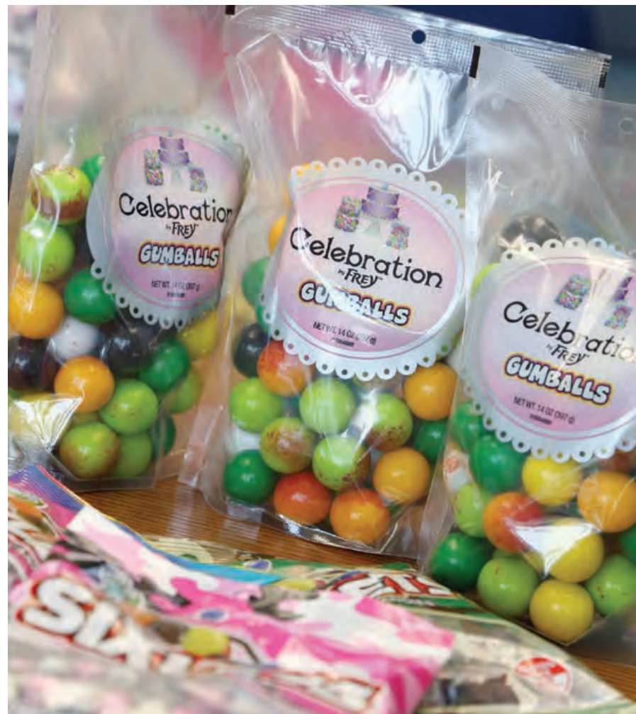
Colorful examples of the Celebration by Frey brand gumballs, whose outershell coatings are colored to resemble orchard-fresh fruit.

He says that while the company could indeed have spent more money and bought a larger or faster