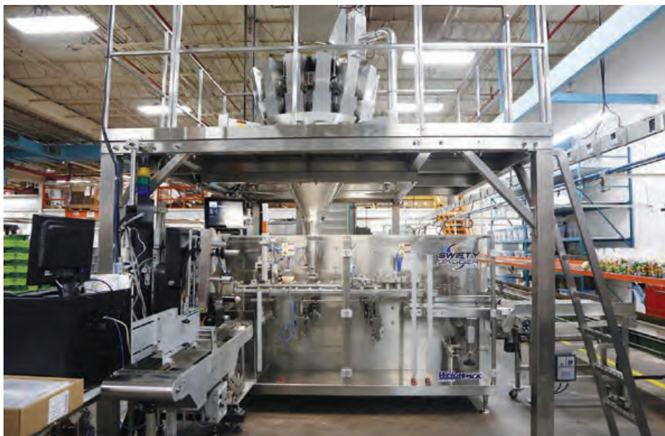
Oak Leaf installed a turnkey, all-in-one WeighPack Systems packaging line at its Toronto facility, including a PrimoCombi multihead weigher, Swifty 3600 bagger, and an incline infeed conveyor to move product up and inside the checkweigher.