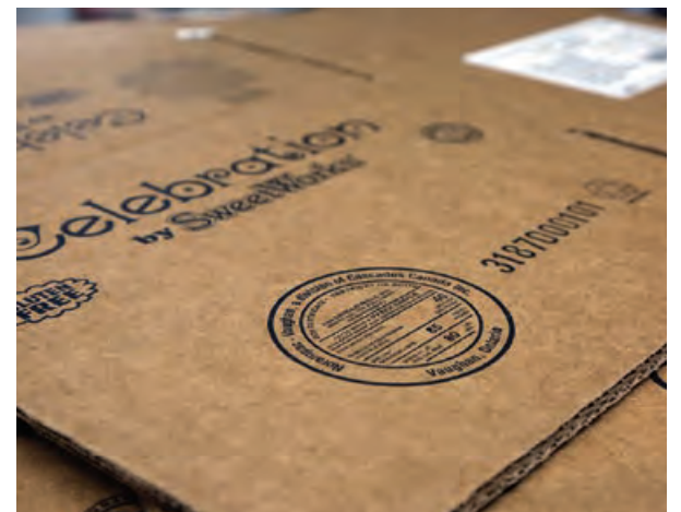
Flats of corrugated cases converted by Norampac, a division of Cascades Canada, will be used by Oak Leaf workers to pack and ship finished gums, chocolates and pressed candies to customers all over the globe.

Please see the online video of Oak Leaf discussing the pluses of their WeighPack Systems packaging solution on Canadian Packaging TV at www.canadianpackaging.com