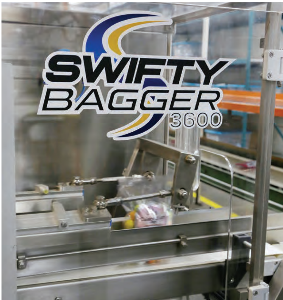
WeighPack Systems' Swifty 3600 bagger receives precision-weighted quantities of gumballs from the PrimoCombi checkweigher above and packs them at a high rate of speed.

"Equipment-wise, we are in the process of moving forward to ensure our packaging line equipment matches the high-end quality of our manufacturing processes," Leoveanu extols.