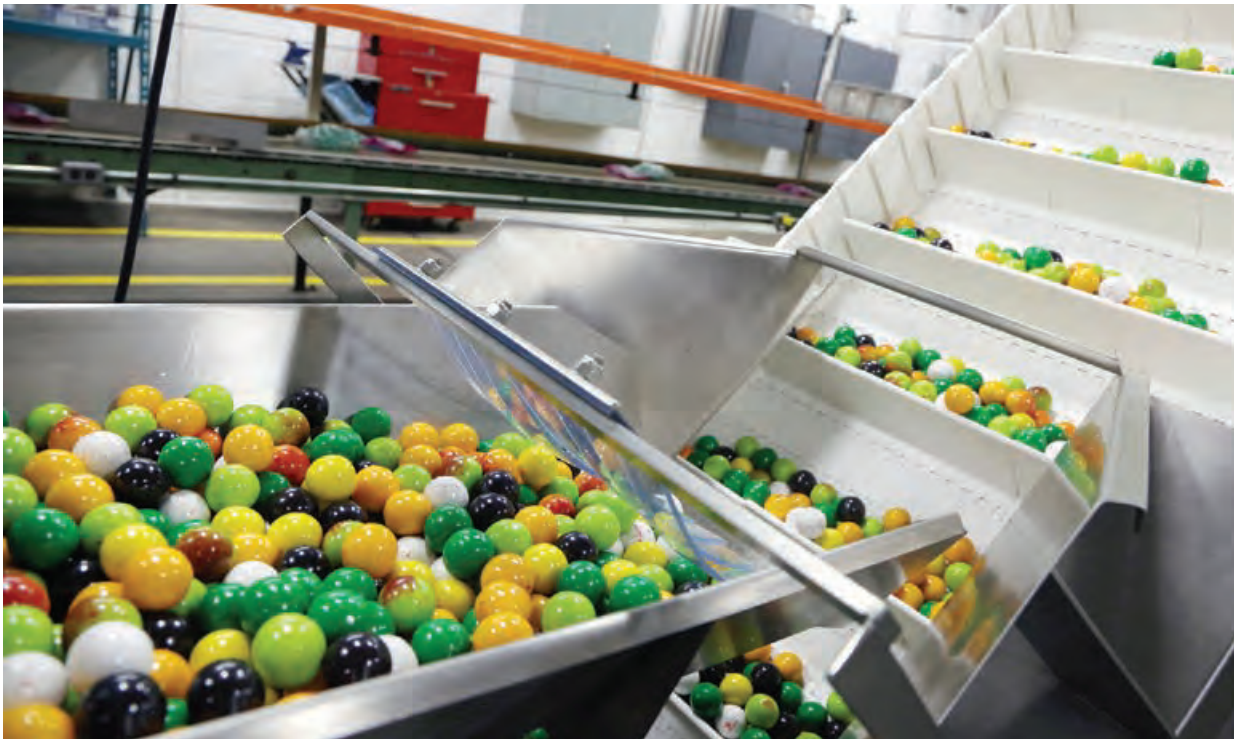
A state-of-the-art inline vertical conveying system from WeighPack gently but quickly moves vast quantities of tasty gumballs from a holding hopper up into a PrimoCombi multihead weighing system where it will be dropped in measured amounts down into a Swiftly 3600 bagging system and sealed in stand-up pouches.